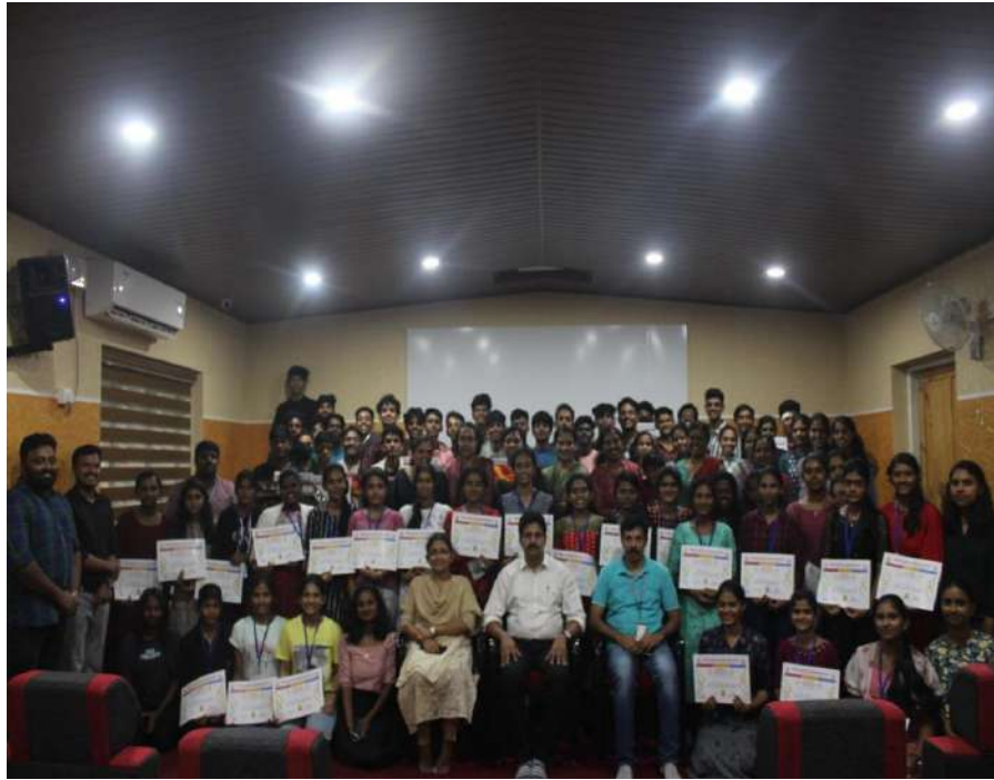
Participants with College Principal and organising team