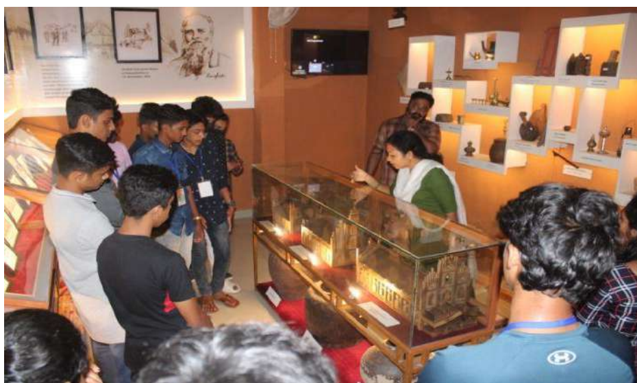
Visit to History Museum